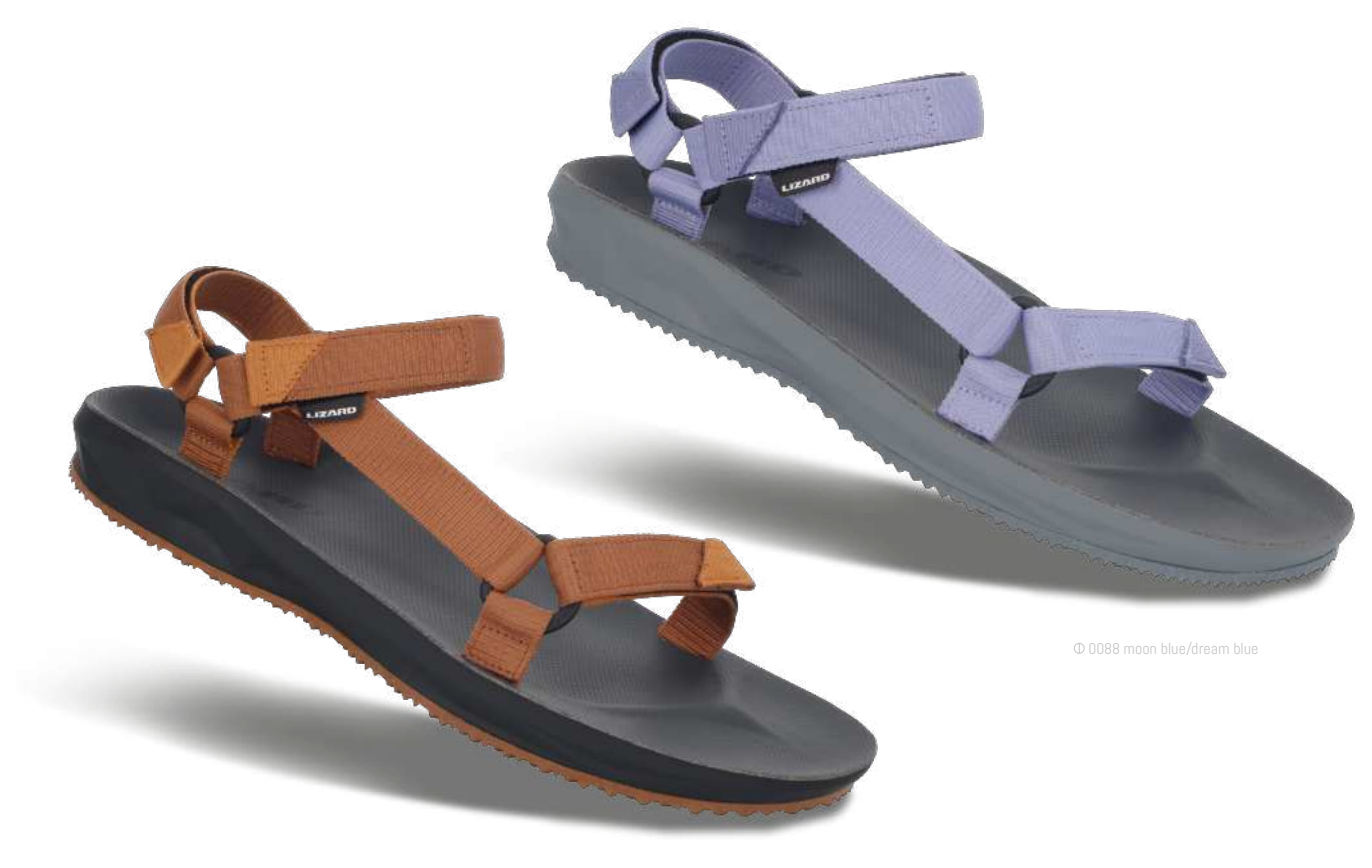
0085 tawny brown/honey brown