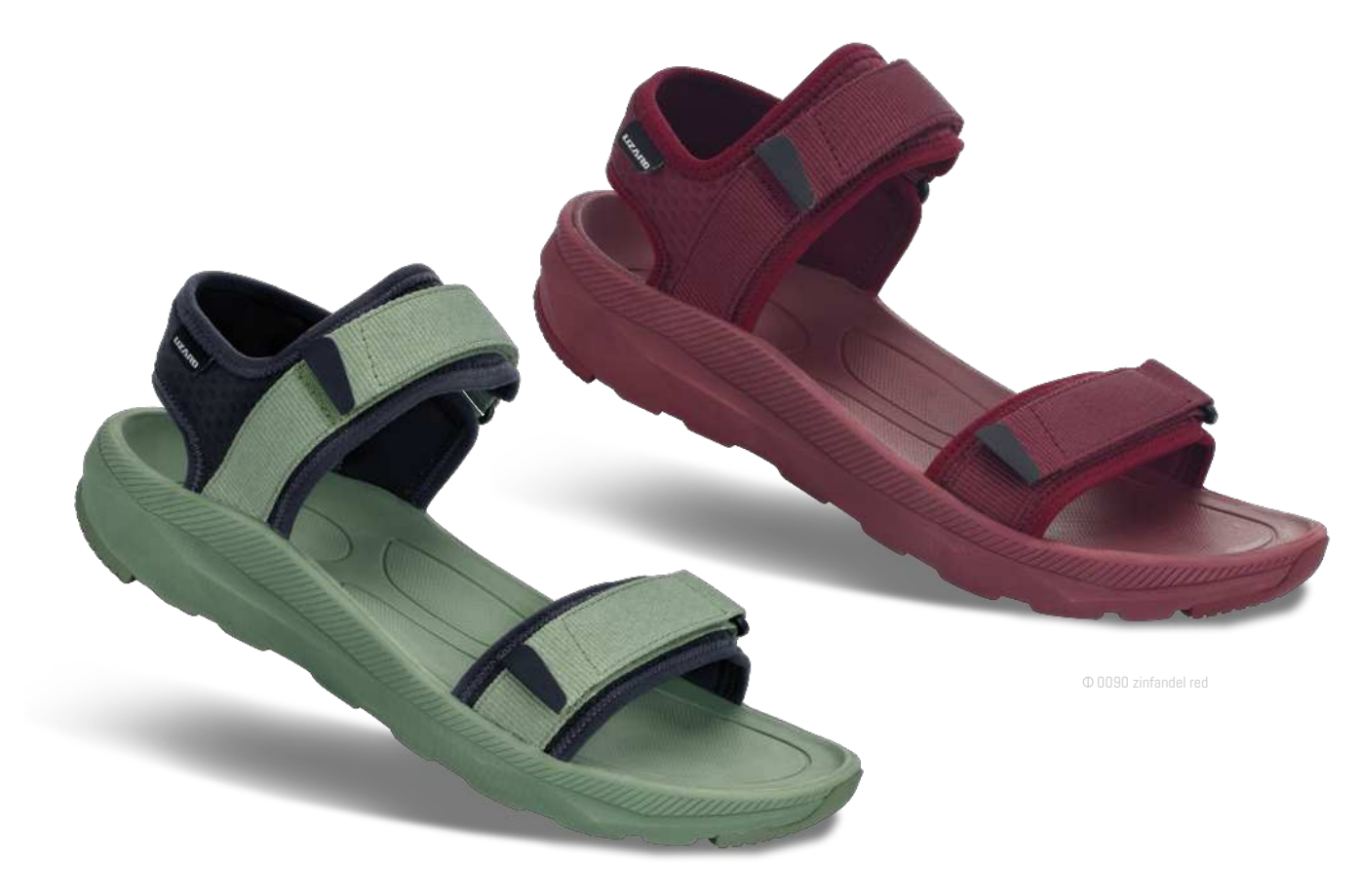
0087 field green/dark grey