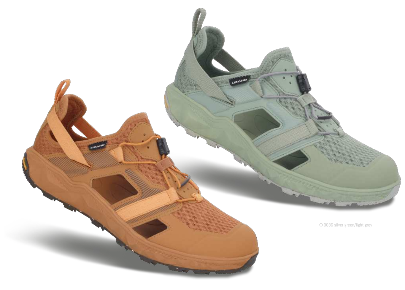
0085 tawny brown/honey brown