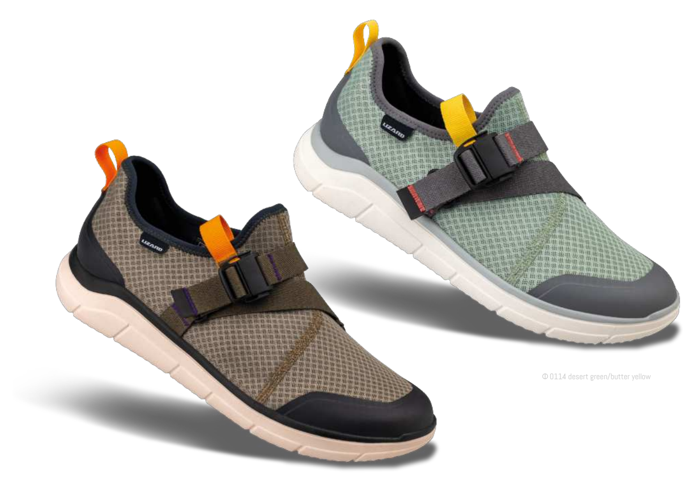
• 0112 dusky green/lizard orange