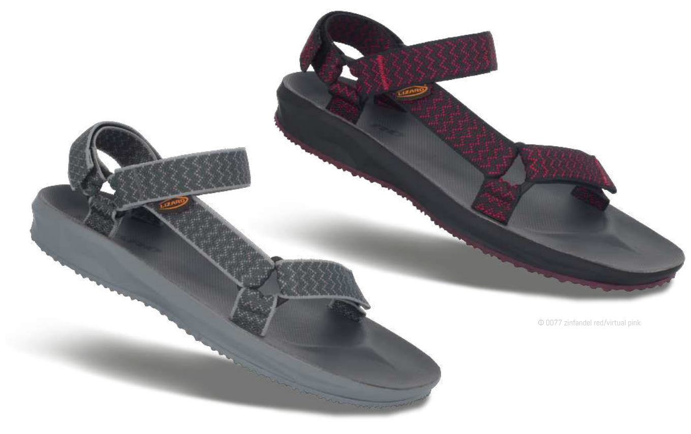
0087 field green/dark grey