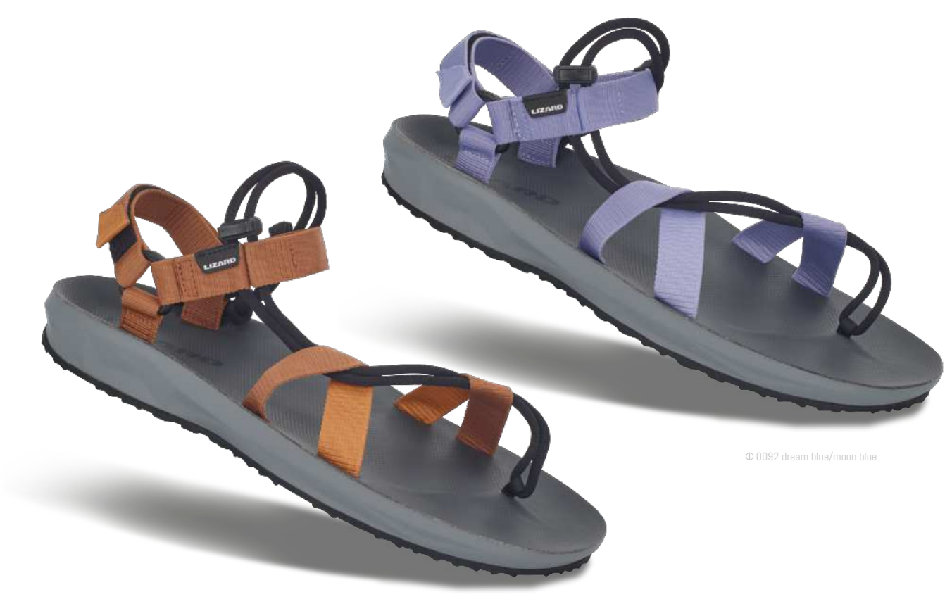
0085 tawny brown/honey brown