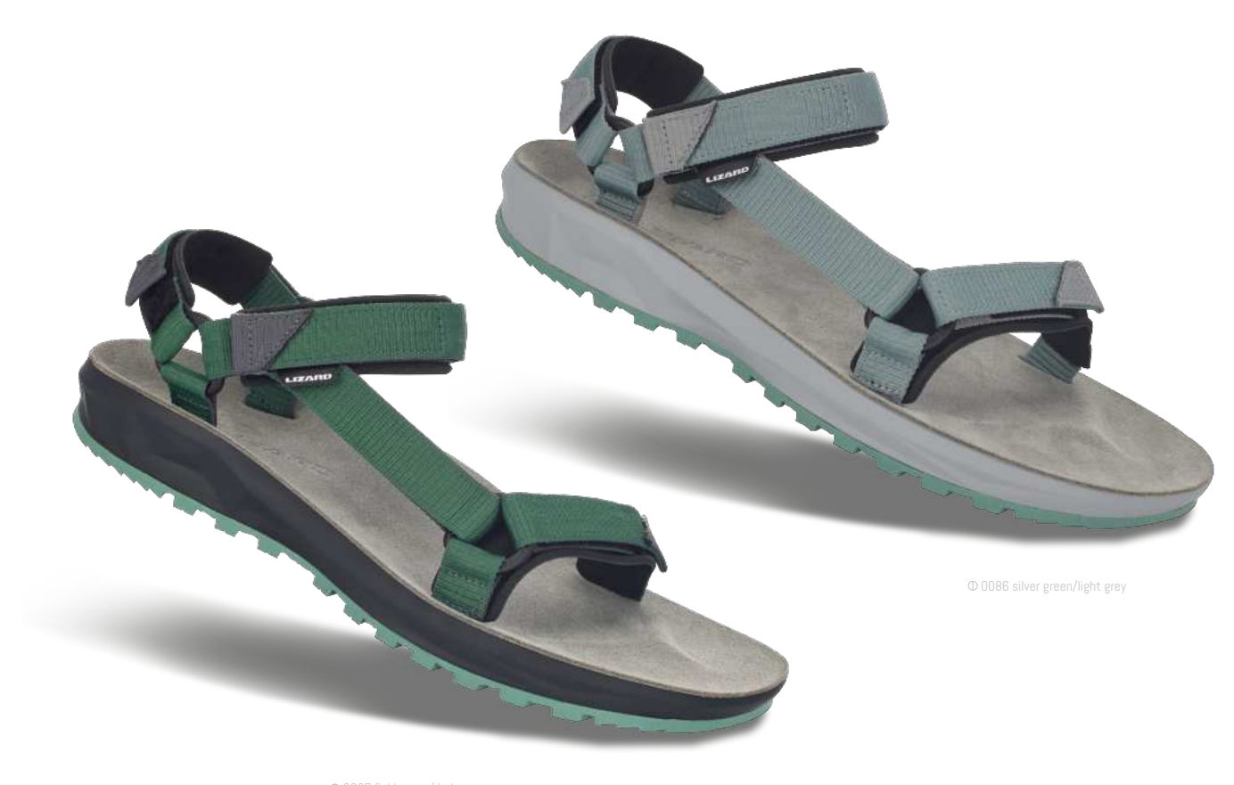
• 0087 field green/dark grey