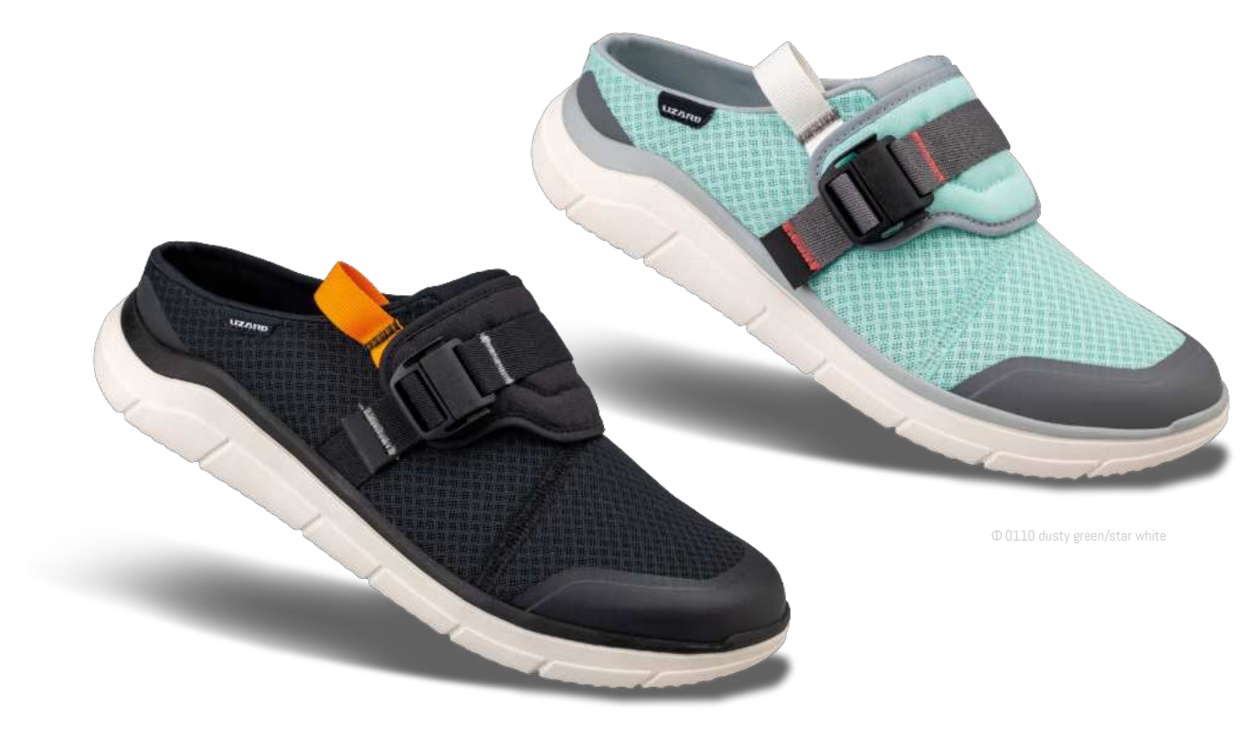
• 0082 black/lizard orange