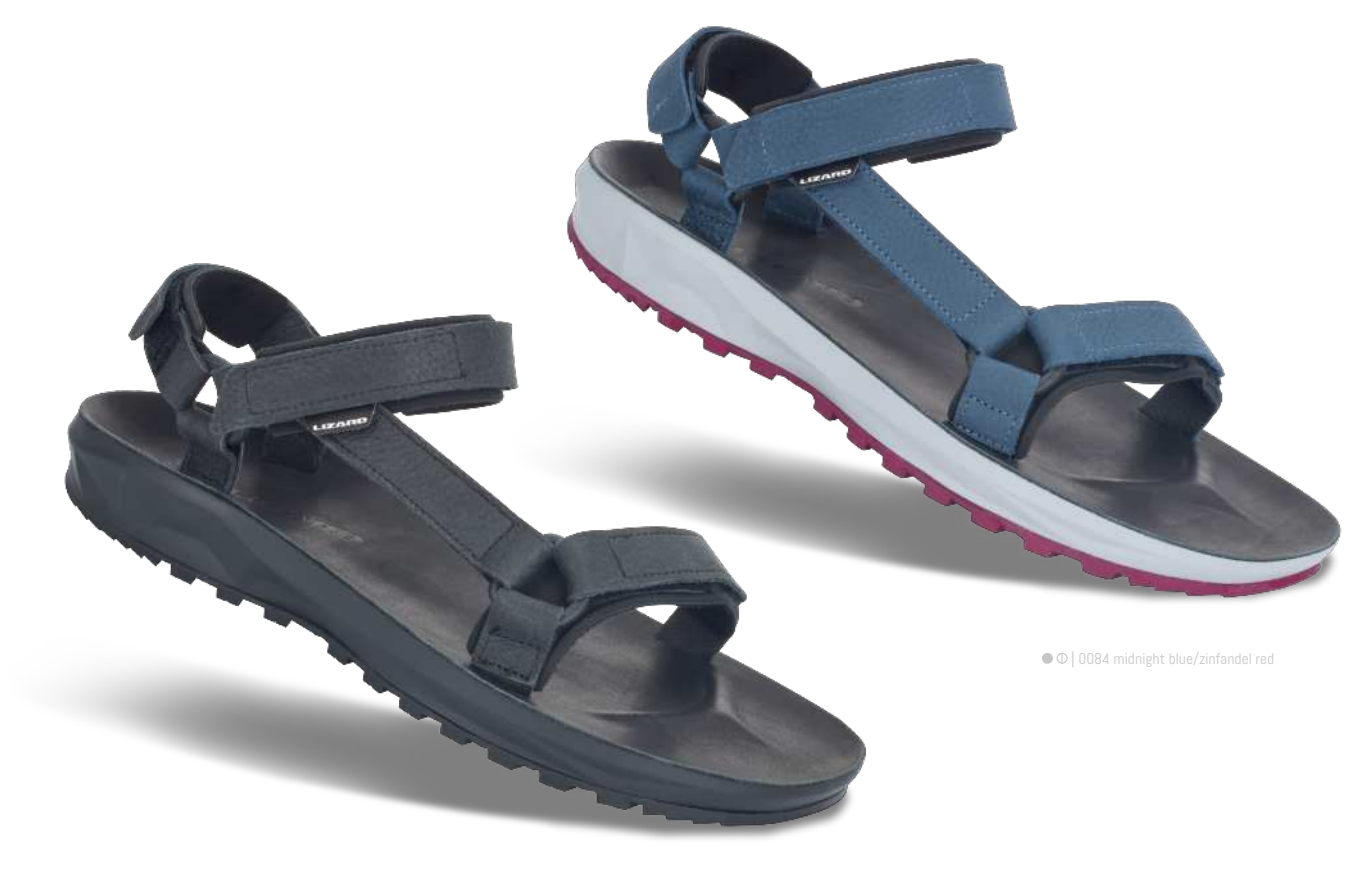
◆ ○ | 0001 black